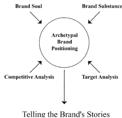
Fig. 1: Revealing the archetypal meaning of a brand

time. In order to help companies implement the archetypes to their brands, Mark & Pearson (2012) created a step by step illustrated in Figure 1.