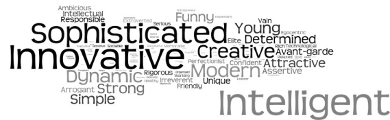
Fig. 3: Personality traits of Apple, according to Portuguese people

The words that appeared most in the question related to the personality of Apple (Modern, Intelligent, Creative, Innovative and Hip) are very similar to the words that the brand itself uses when describing its products, as we will see later on: "The archetype of the Creator is seen in the artist, the writer, the innovator and the entrepreneur, as well as in any activity that uses human imagination. The passion of the creator is the self-expression in material form. (...) The innovator, in any field, departs from the usual business, taking advantage of their unique ability to imagine a different way" (Mark & Pearson, 2012, p. 235).