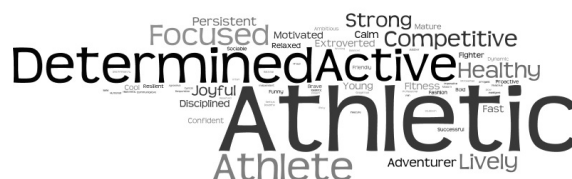
Fig. 4: Personality traits of Nike, according to Brazilians

In Figures 4 and 5 we can see the word cloud generated from the description of the brand personality. It is noted that the traits mentioned by respondents are very much related to the product that the company sells (active and athletic) as well as the characteristic of athletes (competitive) and of a heroic person (determined and focused). Interestingly, the Portuguese respondents also see the brand as relaxed and funny, traits that were not much cited by Brazilians.