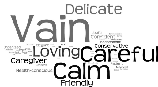
Fig. 6: Personality traits of Nivea, according to Brazilians

mother (careful, caregiver, loving). In addition, the word vain refers not only to women but also to the category of products that the brand sells (moisturizers, facial products, soap etc).