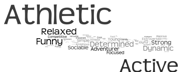
Fig. 5: Personality traits of Nike, according to Portuguese people

Even with respect to the profession, the respondents strongly related it to sport. As seen in Table 3, the overwhelming majority of responses focuses on the professions Athlete, Personal Trainer and Physical Educator. All the other professions